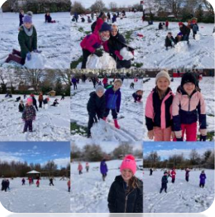
Thursday 16th March 2023